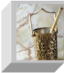
Holy Water Vessel A vessel used for sprinkling Holy Water during the Liturgy. $587

Altar furnishings are not inexpensive. Some very poorly made and mass produced items for church use often cost the same as better made hand-crafted items. The Desmarais-Robitaille company in Montreal design and manufacture all of the furnishings shown below. Most of our church furnishings are from this well respected studio.