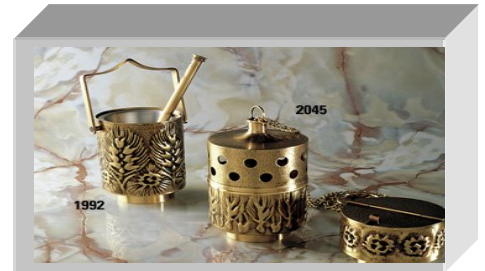
Thurible & Boat These contain and burn the incense for the liturgy. $875