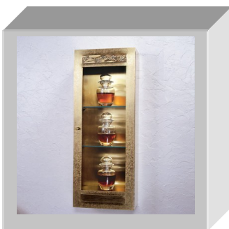
Ambry This display unit made of brass and glass contains the Holy Oils used in the Sacraments of the Church. The Ambry will be located near the baptismal font. $2,420