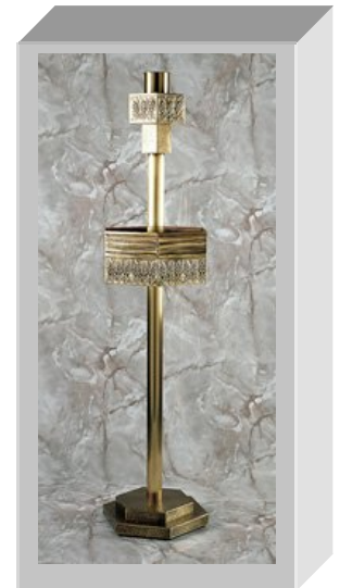
Paschal Candle This large tall candle is lit at Easter. It is used during the Easter season and at baptisms, funerals and other major feasts. The candle holder needs to reflect the dignity and solemnity of the Resurrection $1,925