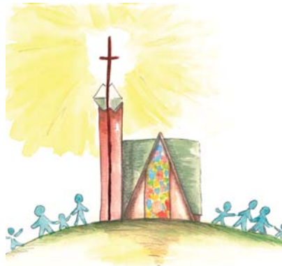
Caring For Our Future

Campaign Status: $338,747 Number of Donors: 38 [Cash & Securities: $143,897 Pledges: $194,850]