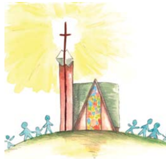
Caring For Our Future