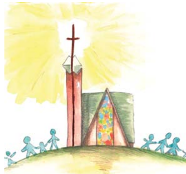
Caring For Our Future

Thanks to all who participated in our great campaign Kick-off! Our goal is to obtain pledges for $1.9 million over 5 years to do needed maintenance over 5 years.