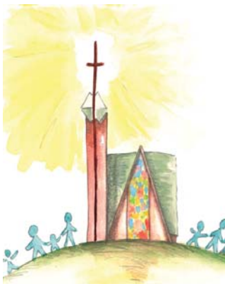
Caring For Our Future