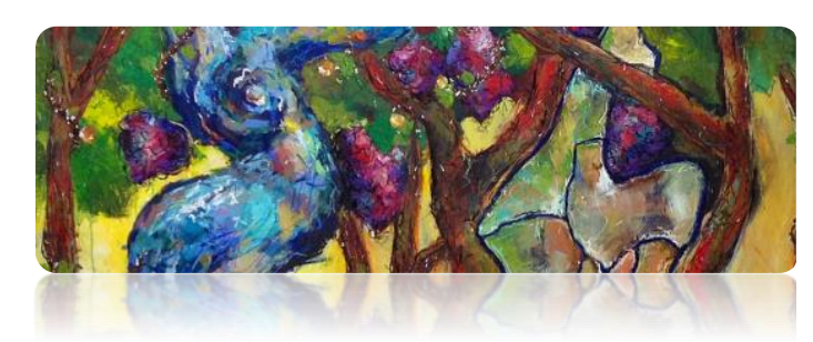
In your goodness, O God, you provided for the needy ~ Psalm 68

Private Prayer: Contact Friar Boniface at 416-447-5571 ext. 500