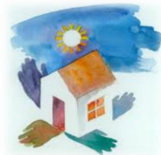
St. Clare Inn

Free T-shirt and BBQ lunch included with registration