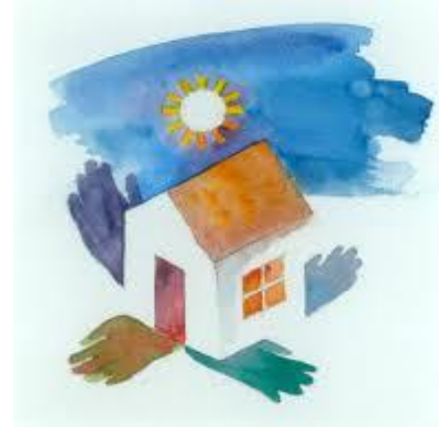
St. Clare Inn

Free T-shirt and BBQ lunch included with registration