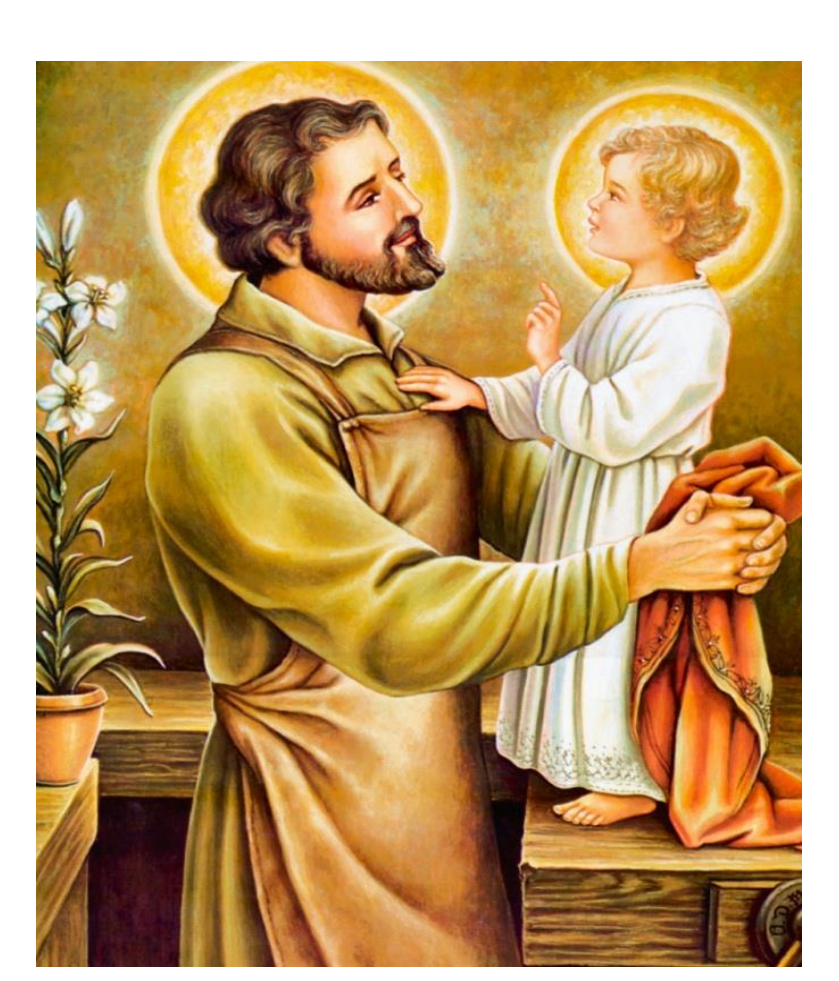
Father's Day Prayer

A 'Special' 7 Day Pilgrimage to Fatima will be offered from 3 Airline Gateways. Information brochures and reservation forms are available at the Catholic Tour, call toll free number 1-877-627-4268 or simply e-mail iimadair@thecatholictour.com