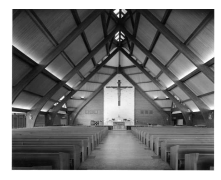
The Anniversary of the Dedication of The Church ~ Solemnity

"The work we see complete in this building is physical; it should find its spiritual counterpart in your hearts. We see here the finished product of stone and wood; so too your lives should reveal the handiwork of God's grace. Let us then offer our thanksgiving above all to the Lord our God, from whom every best and perfect gift comes. He it was who inspired in his faithful people the will to build this house of prayer; He stirred up their desire and gave them His help."