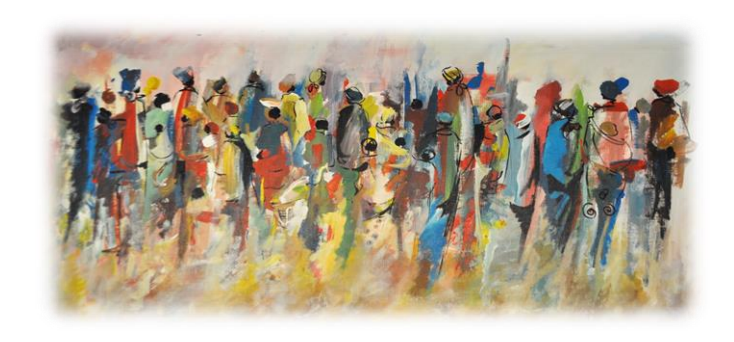
"Go, make disciples of all nations; I am with you always, to the end of the age." ~ Matthew 28.19-20 ~

Private Prayer: Contact Friar Boniface at 416-447-5571 ext. 500