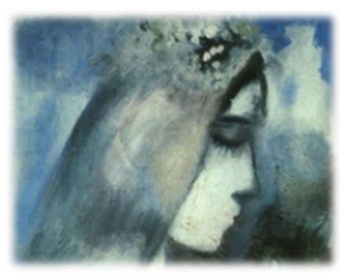
THE PARABLE OF THE PERSISTENT WIDOW LUKE 18. 1-8

WE ARE REMINDED THAT PRAYER CANNOT EXIST WITHOUT OUR FAITH: A FAITH THAT IS DEEPLY ROOTED IN OUR LOVING RELATIONSHIP WITH OUR FATHER. OUR FAITH IN GOD'S LOVE FOR US GIVES US THE STRENGTH AND THE COURAGE TO BE PERSISTENT WITH OUR PRAYERS. WE TRUST IN GOD'S PROTECTION BECAUSE WE KNOW THAT OUR HELP IS "FROM THE LORD, WHO MADE HEAVEN AND EARTH."