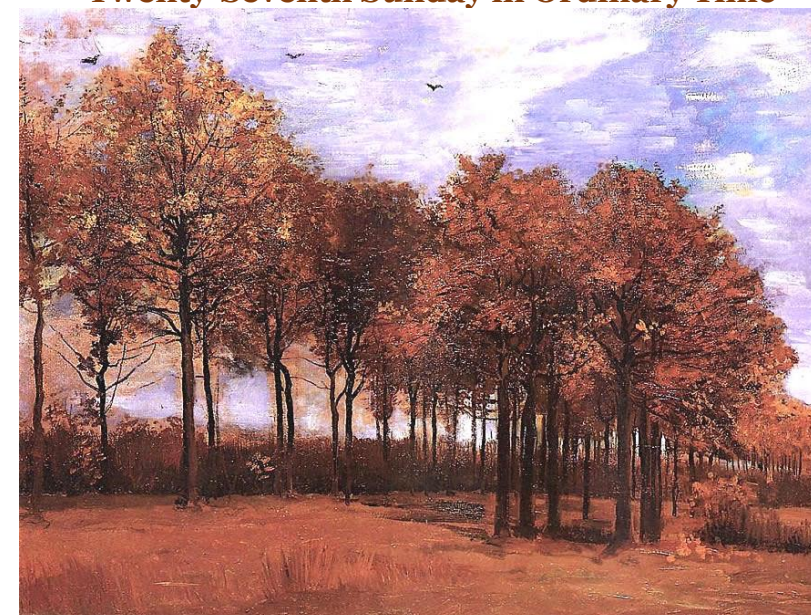
~ Vincent Van Gogh, Autumn Landscape, 1885